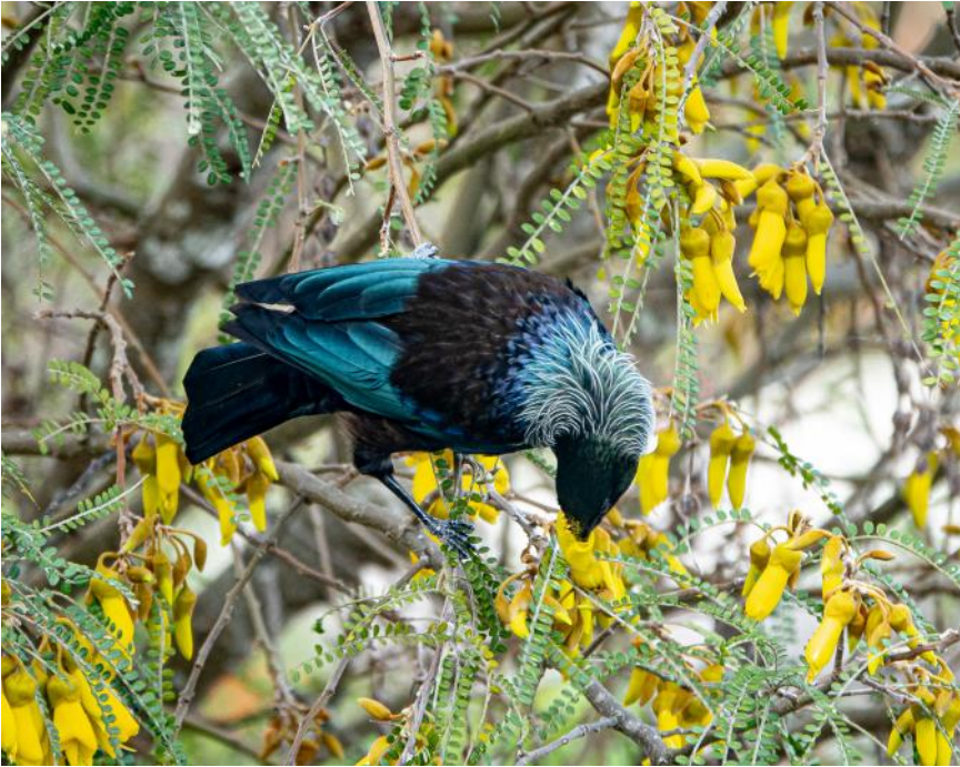
Tui feeding in Kowhai