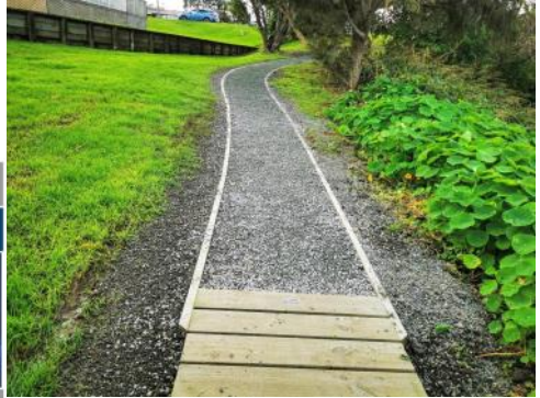
Completed walkway Cumberland to Harbourview