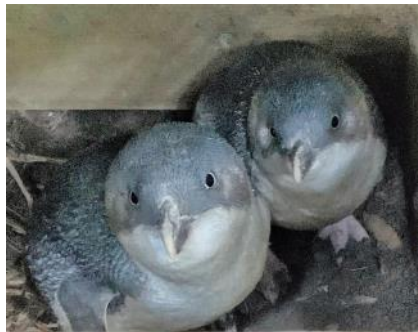
A pair of little blue penguins investigate one of the artificial nest boxes, prior to the 2020 breeding season.

The Leigh Penguin Group are working to protect this threatened bird. There are now around 70 penguin boxes secreted away in locations along the coast from Ti Point around to the Goat Island Marine Reserve. These artificial 'burrows' offer a relatively safe alternative for penguins seeking somewhere to rest, moult or nest. Using trail cameras, the group have also located a number of natural burrows along our coast, where penguins make their home. In addition to providing safe homes for penguins, the group are also working to reduce the number of predators. There are now more than 180 monitored traps along the coast. A team of more than 20 volunteers work to keep the traps baited and set. The kororā thank you!