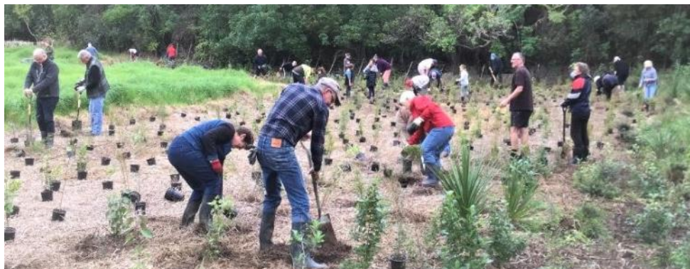
Team of planters at Matheson Bay Reserve on July 4th