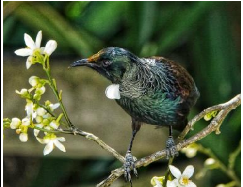
Tui in a grapefruit tree.

info@webstermalcolm.co.nz www.webstermalcolm.co.nz