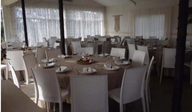
Leigh Central's main function room, set up for their first wedding with over 130 guests.

This month Leigh Central on the site of the old Leigh Hotel becomes fully operational with its first wedding. This is a fantastic asset for Leigh, the residents of which having complained about the derelict hotel over the past 10 years or so.