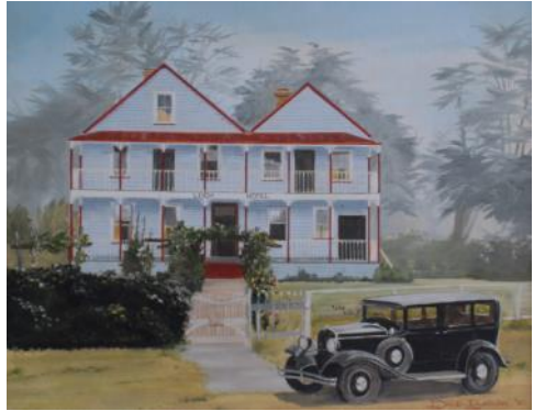
Cumberland Hotel at Leigh