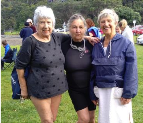
Matheson Bay Bathing Belles